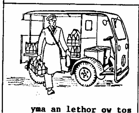
yma an lethor ow tos

Yn stret an teylu Banalek - Stret an Avon - yma an lethor ow tos. Hanow an lethor yw Mester Polglas. Den hir yw ev ha deg bloedh warn ugens y oes [10 warn 20 = 30].